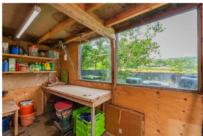
Workshop/ Garden store 13'6" x 7'6" (4.13m x 2.31m )

There is a second area behind the main garage with a door side and with power and light laid on. The power has been enabled for the installation of an electric vehicle charger.